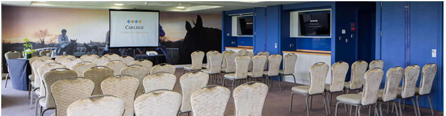
*Picture shows a two box combination.